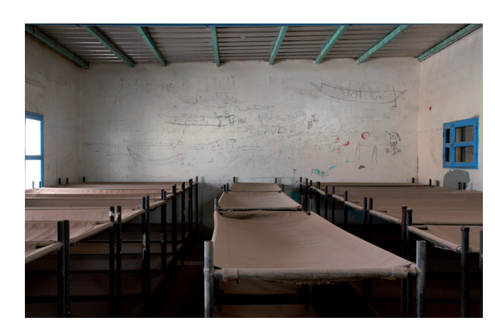
Figure 2.- Walls at CIE Mauritania.

recommendations, dreams, etc. – from the people who temporarily were detained there. The artists were fascinated by those graphic demonstrations and they decided to keep the immigrants' memory alive by spreading their word and works outside the centres. The project posed a challenge for the artists twofold: in addition to the vast amount of references and writings on the walls in both centres, it soon became apparent that they were to face difficulties in the technical side, that were not going to be easy to solve by themselves.