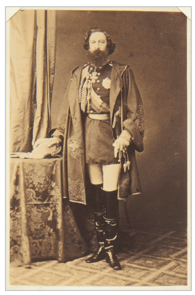
Figure 1.- Photograph of King Ferdinand II of Portugal.