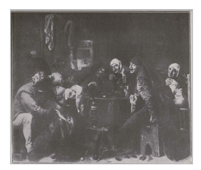
Figure 6. - "A Bambocciata", signed by Adriaen Brouwer, restored by António Tomás in 1850. This painting was purchased by the Count of Ameal in 1893 at the auction of the collection of paintings of King Ferdinand II, and its current location is unknown. Sousa and Matos Sequeira 1921.