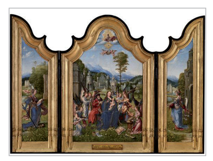
Figure 8. - Flemish triptych depicting the Holy Family, that has been attributed to Jan Gossaert, and more recently to an unknown artist. Museu Nacional de Arte Antiga 1479 Pint.

cost of the "restoration of a triptych by Van Dyck belonging to His Majesty Dom Fernando King of Portugal." [17]. This was very likely the exquisite Flemish picture depicting the Holy Family with Saint Catherine and Saint Barbara [Figure 8] [18], that used to hang in the King Consort's private office at Necessidades Palace, and that upon his death was said to be a Jan Van Eyck (Inventário 1885: 2214).