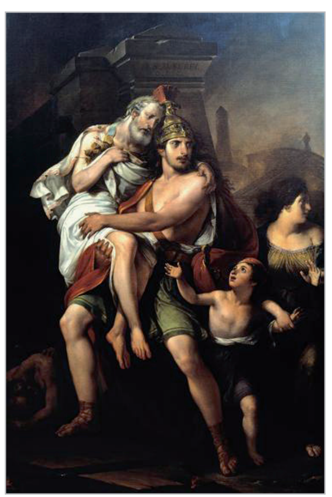
Figure 4. - "Aeneas saving his father Anchises from burning Troy", by António Manuel da Fonseca, Palácio Nacional de Mafra 1772.

In general, these paintings, including one considered by Fonseca as "exquisite"[8], as well as two Bassanos, were largely damaged, ruined by "terrible"[9] retouches and covered in several layers of oil varnish. In fact, the former was so badly damaged that the artist felt the need to point out that this specific restoration required a lot of work, a particularity which was reflected in the price of the procedures: 24$000 réis, the highest cost for any work undertaken by Fonseca in 1858. Given the overall situation of this set of paintings, the general aim as was common at that time was to "re-establish the primitive originality"[10]. To this end, Fonseca used an unspecified cleaning method to remove dirt, retouches and varnishes, followed by the restoration itself, which, according to his notes, was carried out with the original artist's intent in mind. The intervention on two 16th century battles by Jacques Courtois was slightly different, as these pictures were not only cleaned, but also relined and put into new stretcher frames in order to successfully maintain in place the painted canvas.